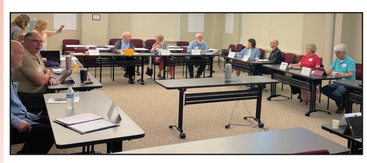
The first hybrid Curriculum committee meeting is a success!