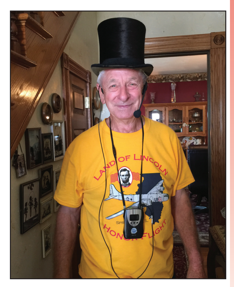
The docent gets into the act with a stovepipe hat during a past OLLI visit to the Metamora Courthouse State Historic Site.

What is the best practical joke you ever played on someone and/or someone played on you? How did you pull it off? We want to hear about your crazy adventures and/or misadventures as the case may be.