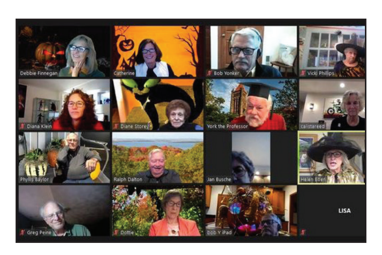
OLLI members have fun dressing up for our Halloween themed Zoom.