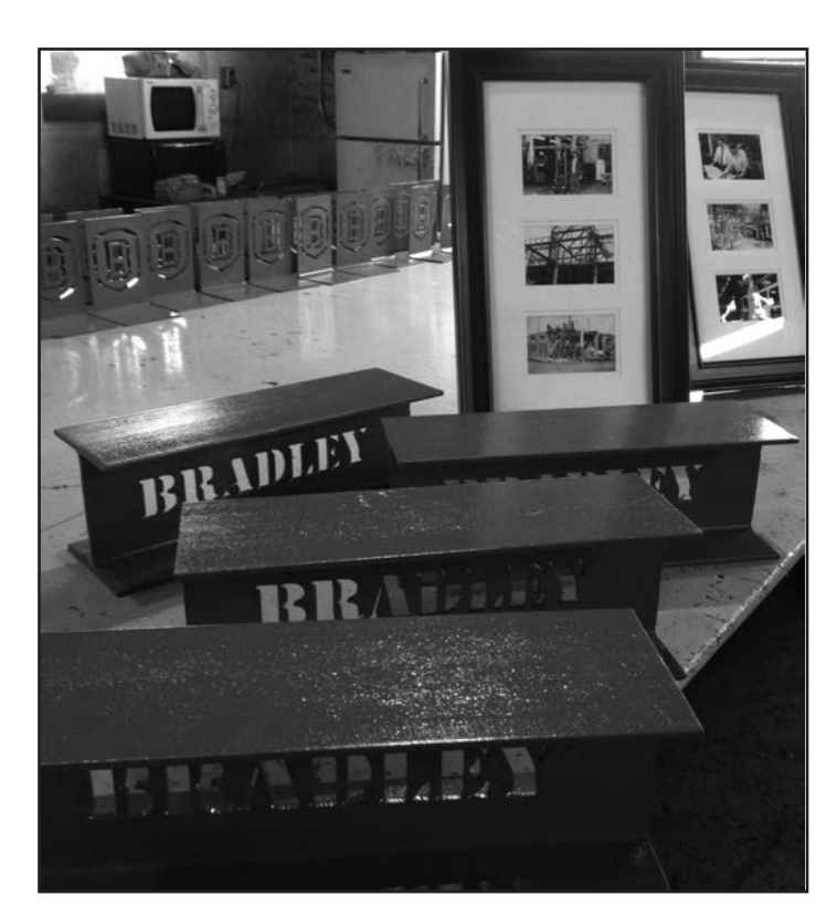
Go Far, Go Bradley! Staff at A. Lucas & Sons Steel showed their BU pride by making bookends and other gifts for OLLI members who toured the facility last winter.

Peoria County's new elder care facility, Heddington Oaks, will welcome residents this June. On this trip, we'll visit Heddington Oaks to learn about the process of constructing a tax-supported facility: identifying the need, weighing renovation vs. building new, determining size of the facility, funding options, and the bidding process. We'll tour the 214 bed, state-of-the-art facility that was built to LEED Silver design and construction standards and offers both inpatient and outpatient therapy services, includes secure housing for 80 Alzheimer's patients, and has the