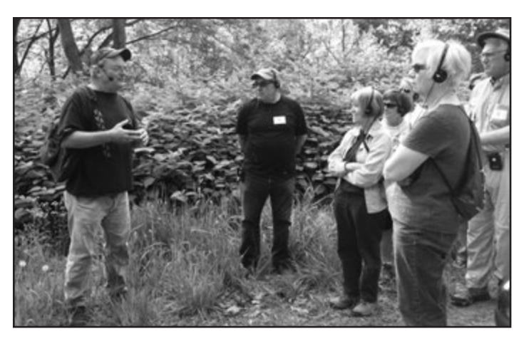
OLLI members discover the hidden gem that is Rocky Glen through a hike of the geological preservation.

On the 11th hour of the 11th day of the 11th month of 1918, World War I ended, not with a surrender of the Central Powers but with an armistice. In January 1919 the allied powers, led by Great Britain, France, and the United States, met in Paris to write a treaty that would officially end the war with Germany, the Austria-Hungarian Empire,