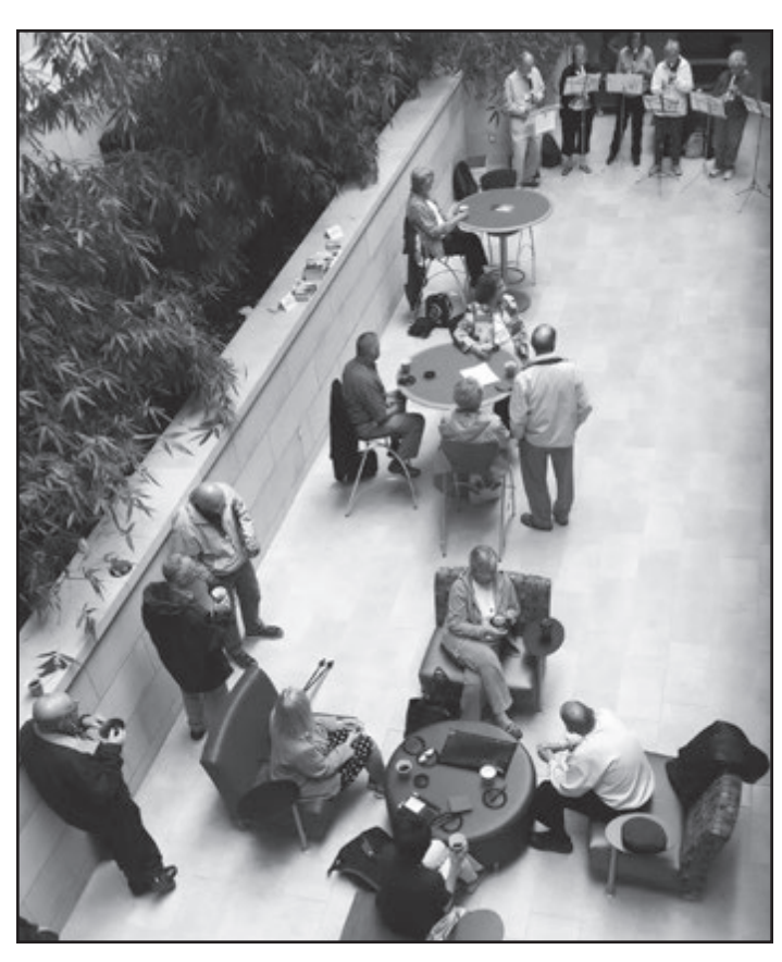
Class participants are entertained by the OLLI Recorder Ensemble during a break in classes at Westlake Hall.