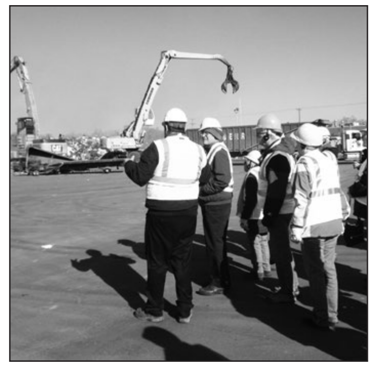
OLLI members, equipped with helmets and reflector vests, observe Behr Recycling's 5-story "monster shredder," capable of shredding a car in two seconds!

$79 – includes private tours and presentations, lunch, gratuities, snacks, and charter coach transportation