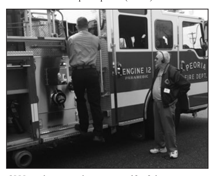
OLLI members got a close-up view of fire fighting equipment during a visit to the Peoria Fire Academy.

This class is designed for all skills levels. The instructor will provide drawing templates for your convenience and will give a step-by-step demonstration for the class to paint together. If you have never used watercolor pencils you are in for a treat because they are easily transportable, convenient to use, and provide beautiful results! Class subjects will vary including flowers, landscapes, and more! Jean Gronewold, returning OLLI instructor and artist, will share some of her drawing secrets using short demonstrations. A supply list will be provided, and the class is limited to 10 participants. (RI/RC)