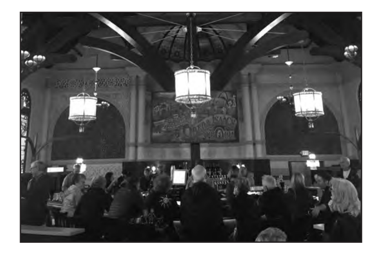
OLLI members take in the majestic renovations during a tour of Obed and Isaac's Microbrewery.