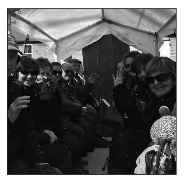
An OLLI hello! Members wave during a visit to Cramer Creek Farm.

The health care system in the United States is large, complex, and expensive. It now consumes almost 18% of our nation's gross domestic product, and clearly affects every citizen. In this class, participants will learn about the evolution of the current delivery system from small cottage industry to its current form; the current financing system, including factors leading to escalating costs of health care; and education of the workforce, including a discussion of provider burnout and teaching civility in the workplace. We will also discuss possible options to provide universal health insurance, including the status of the Affordable Care Act and efforts to repeal or replace it, as well as a look at comparative systems used in other developed countries. The class instructor is Bill Albers, professor emeritus of pediatrics and retired pediatric cardiologist at the University of Illinois College of Medicine in Peoria. (RI/NC)