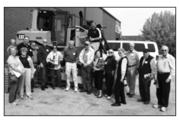
OLLI members pose for a group photo with a Caterpillar D6T tractor after touring the Illinois Central College Dealer Service Training Facility in East Peoria.

$22 – includes lunch, gratuities, tour, and van transportation