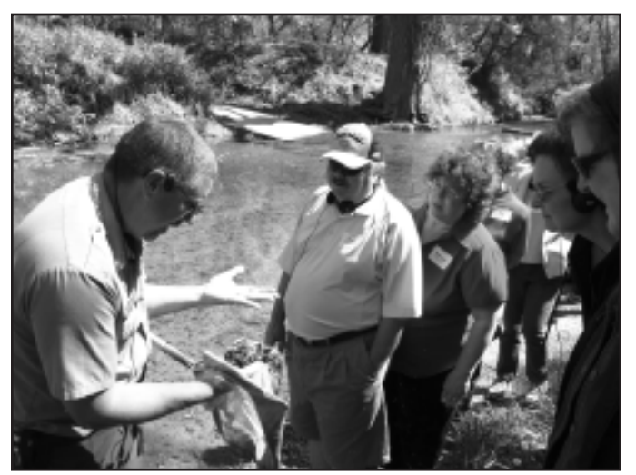
A U.S. Army Corps of Engineers park ranger lets OLLI get hands-on with firefly larvae while exploring the Farmdale Reservoir.

$22 – includes lunch, gratuities, tour, and van transportation