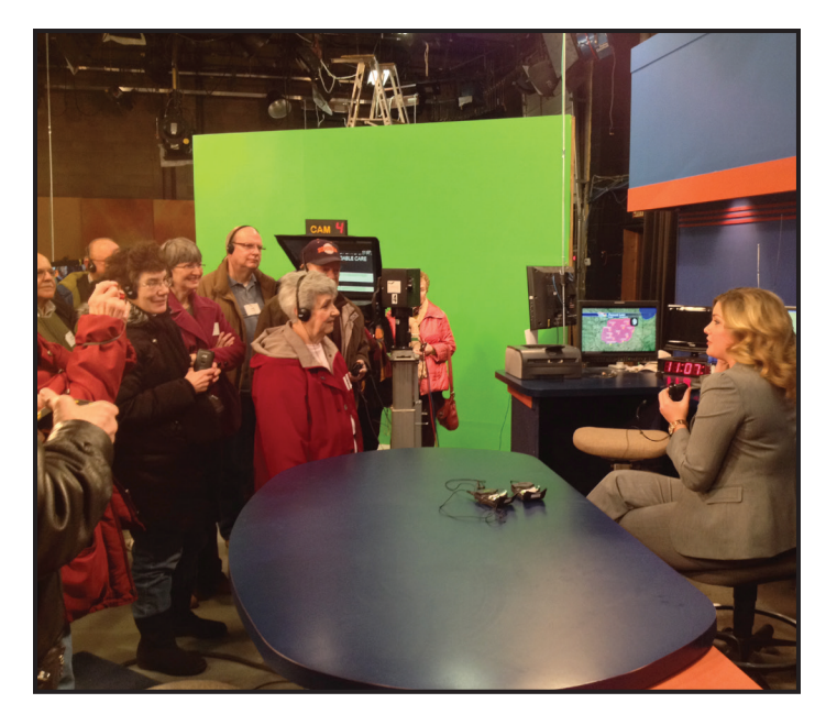
OLLI members get a behind-the-scenes look at WEEK news studio, a great in person learning trip we are looking forward to again in the future.