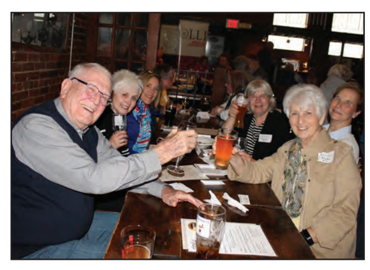
OLLI members gather to learn and socialize at an OLLI Original event.