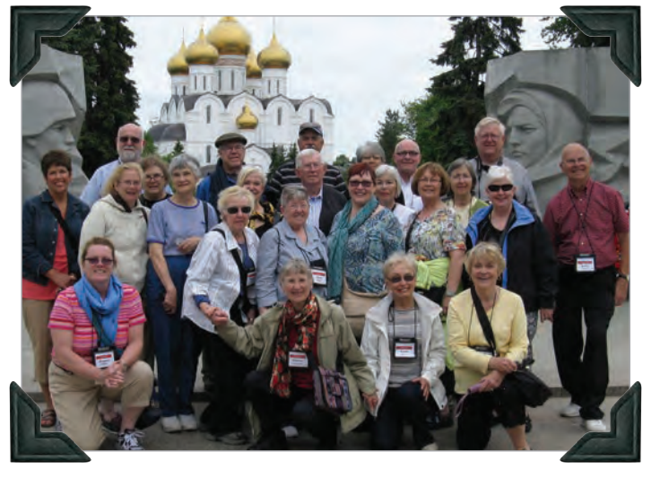
OLLI re-started its international learning trips with a riverboat tour to Russia in 2013.

The people are what make OLLI so very special, and each member is valued. Our dream is that each member will find in OLLI a place where they are welcomed and where they can learn and grow with friends old and new. OLLI's amazing members, donors, volunteers, and staff, continually strive to make our OLLI to be the best in the country. Thanks to all these wonderful people, OLLI will be here for the next 25 years.