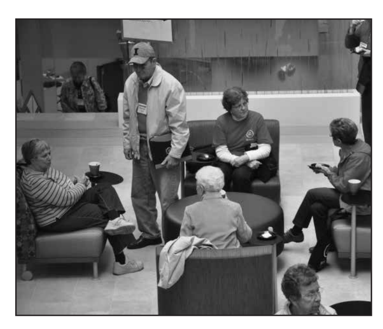
Breaks between OLLI classes are a great time to catch up with friends.

$25 – includes lunch, gratuities, tour, and shuttle transportation