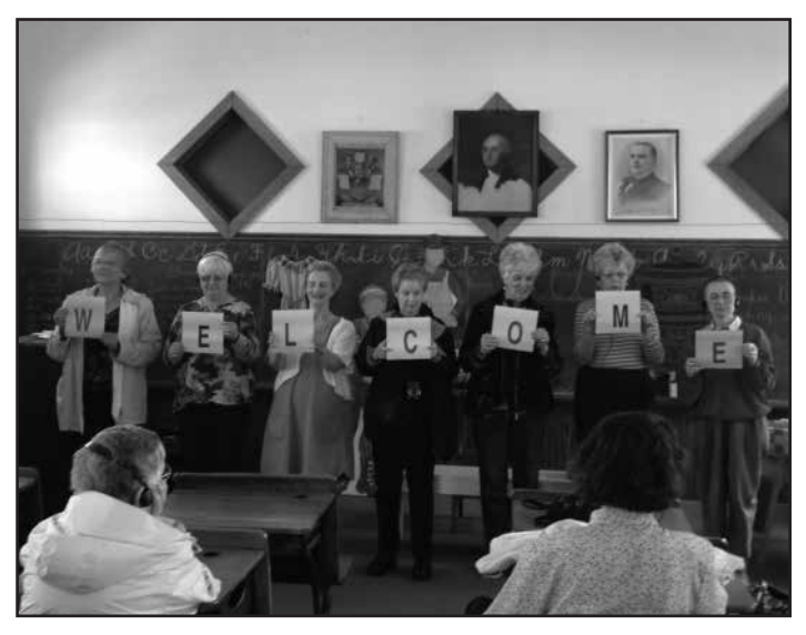
OLLI members are welcomed to a one-room schoolhouse on the campus of Eastern Illinois University.

On this trip, we will visit Midwest Technical Institute, a year-round school providing course offerings in vocational career fields. Our tour of the East Peoria campus will include insight into the eight occupational programs it