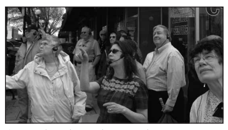
OLLI members admire architecture in downtown Charleston, Illinois.