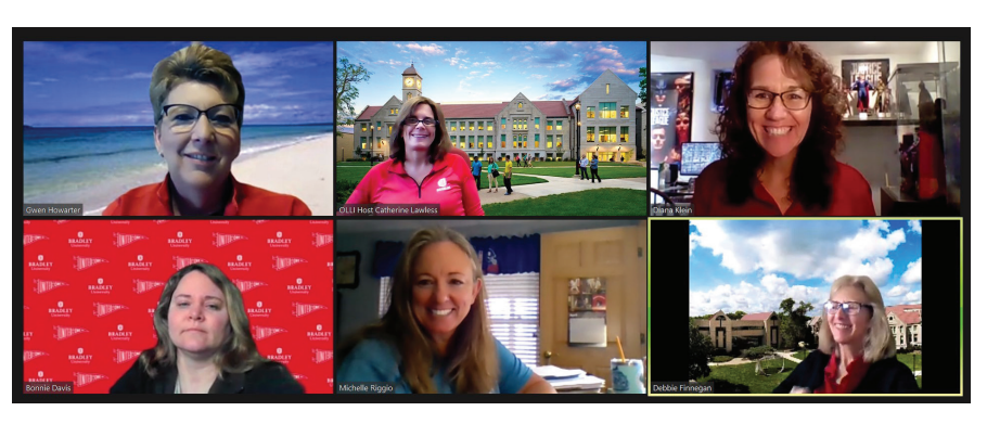
The Continuing Education staff looks forward to seeing you online or in person soon!