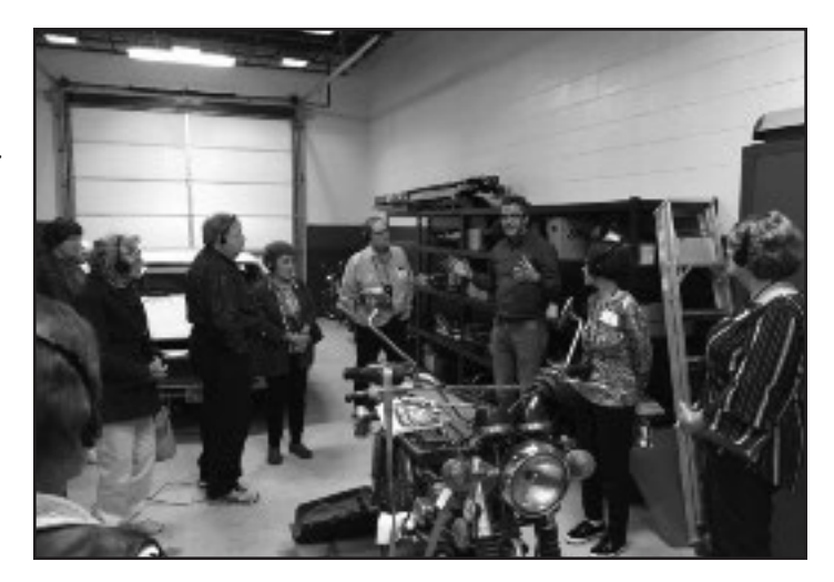
While touring the Dream Center, OLLI members learn about the non-profit's mentorship program for young men and women.

$15 – includes appetizers, two drink tickets, gratuities, and presentation. Transportation not provided – meet us there!