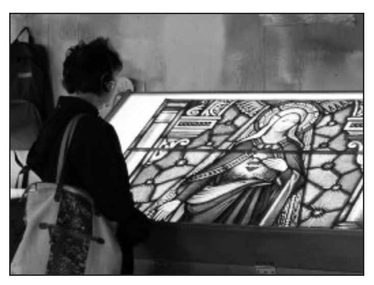
An OLLI member views beautiful artwork on display during a tour of Heritage Restoration in Peoria.