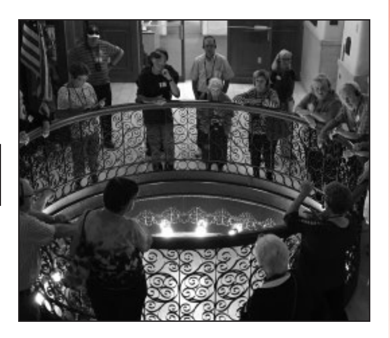
Past and present city leaders present a tour of Peoria City Hall, named the "Best City Hall" in 2017.