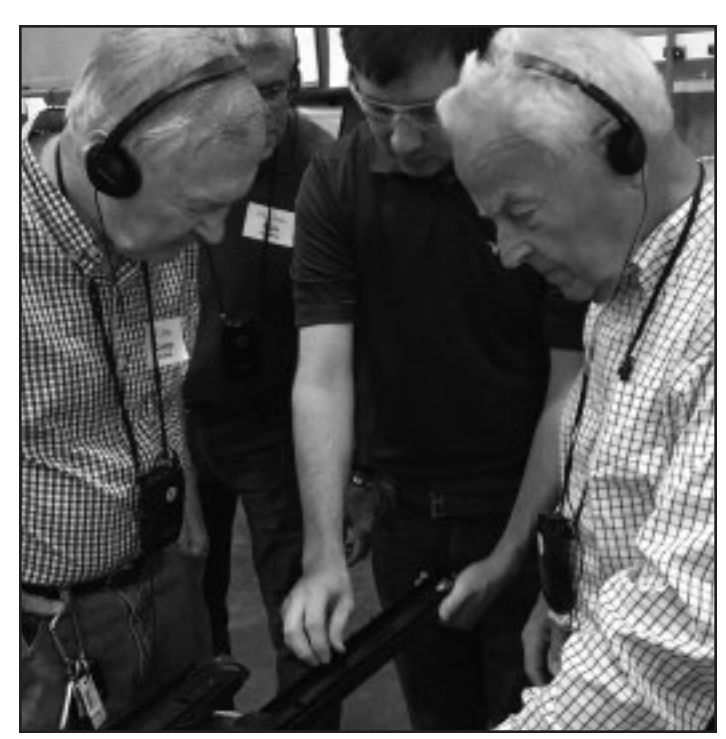
OLLI members get a closer look at a tool used by farmers during a tour of Precision Planting.