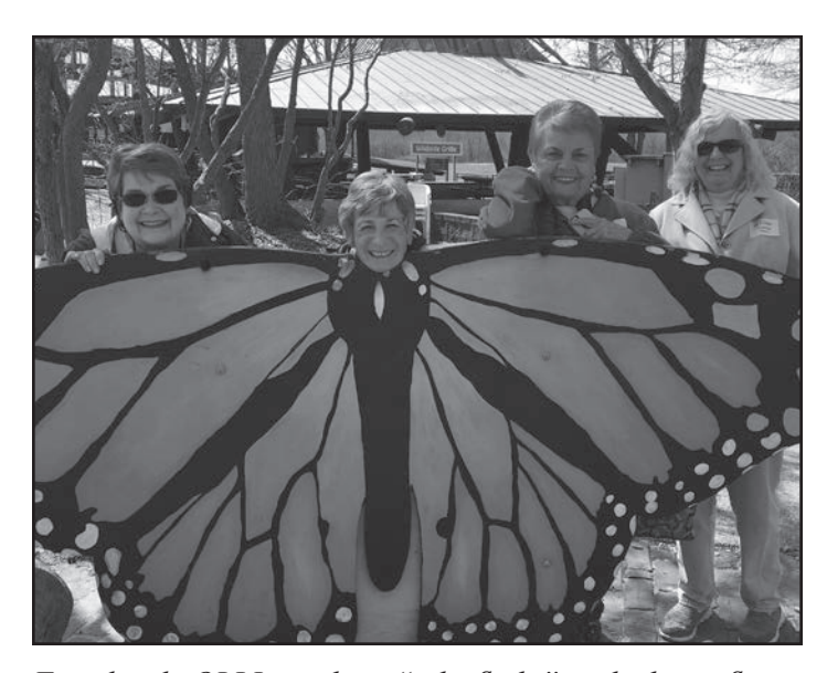
Four lovely OLLI members "take flight" at the butterfly display during a learning trip to Wildlife Prairie Park.

$25– includes lunch, gratuities, tour, and shuttle transportation