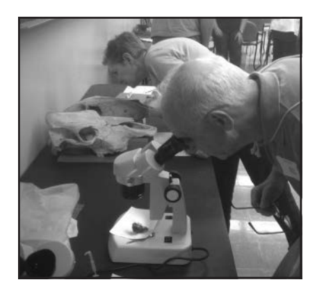
OLLI members examine specimens at Northern Illinois University's Lorado Taft field campus.