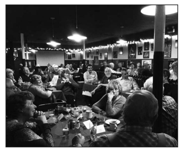
OLLI members enjoy a delicious Italian dinner at Paparazzi and a presentation on Italy.

Parking information for ALL programs will be provided with your confirmation materials. Limited handicapped-accessible parking is available by permit on campus. Please contact us at (309) 677-3900 for details.