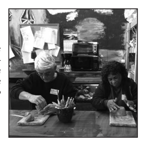
OLLI members practice handbuilding with clay during a learning trip to Wheel Art Pottery.

$25– includes lunch, gratuities, tour, and shuttle transportation