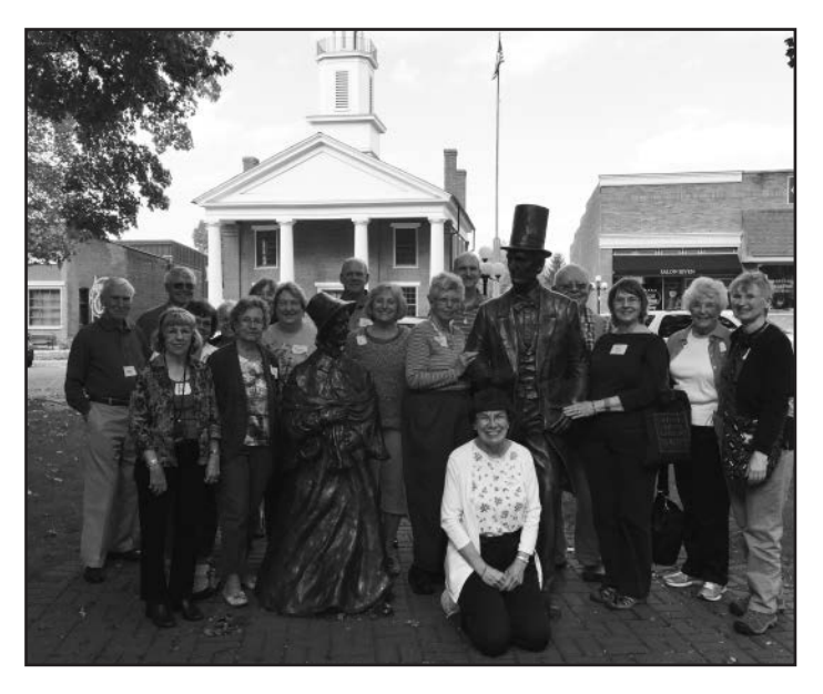
Outside the historic Metamora Courthouse where Abraham Lincoln once presented a case as a lawyer, OLLI members pose with a statue commemorating the event.

We will begin our tour at the Cathedral Basilica of Saint Louis, known for its stunning mosaics and majestic architecture. After a guided tour, we'll have free time to visit the Mosaic Museum containing displays, precious objects, and the crypt containing remains of Saint Louis' cardinals and archbishops. After a delicious lunch in The Hill neighborhood, home to many Italian restaurants and businesses, we'll head to The Fabulous Fox Theatre for