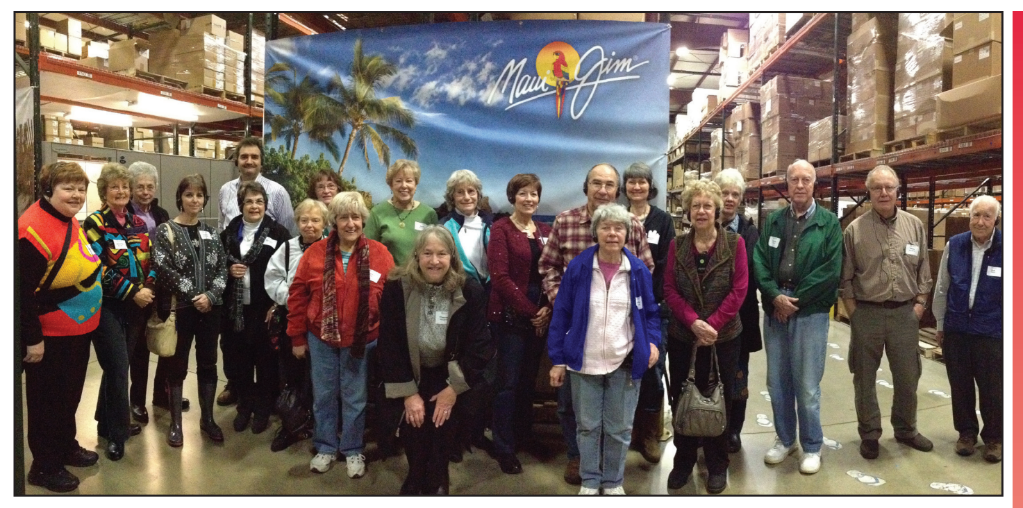
We can't wait to take a trip like this later in 2021! How many of you remember our behind-the-scenes learning trips to Maui Jim World Headquarters?