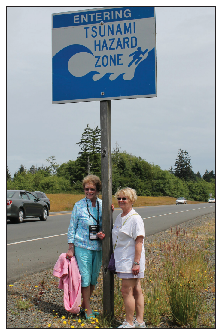
During a past multi-day trip to Oregon, OLLI members have fun posing in the "Tsunami Zone."

OLLI subscribes to an environment of thoughtful discussion and mutual respect; we strive to have constructive exchange of ideas and commitment to civility.