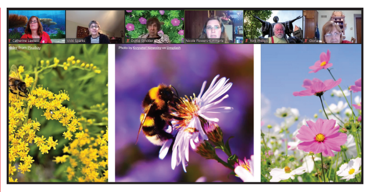
Nicole Flowers-Kimmerle give OLLI members tips on preparing their gardens for spring during classes.