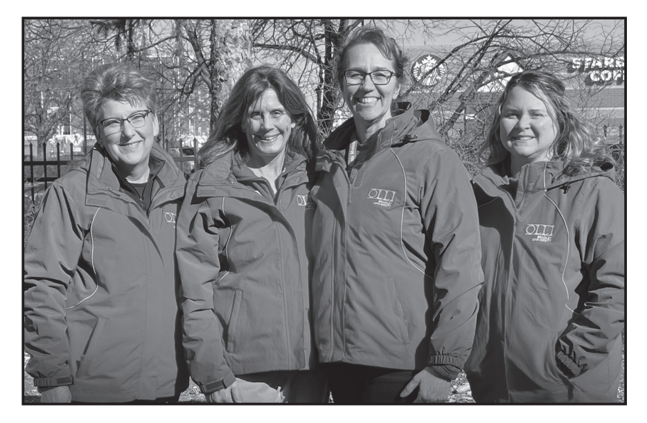
A group of Continuing Education staffers sport their OLLI jackets and smiles as they gear up for more in-person programs this year.