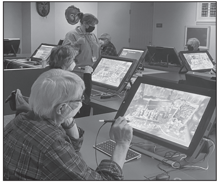
OLLI members take a deep dive into the world of Z Space at Peoria Riverfront Museum.

Taking awesome pictures is easier than ever, and with a few tips and some practice, even beginners can take amazing iPhone photos with very little effort. Join us for this study group which involves "hands on" iPhone photography including understanding the principles of photography in relationship to your phone. We'll learn iPhone camera basics, camera settings, and how to use the camera buttons and tools. We'll explore the iPhone settings such as portrait, landscape, tabletop, editing, and storytelling. We'll also discuss the "in iPhone" photo editing capabilities along with some possible other photo apps. Join photographer Coke Mattingly and tech expert Bob Yonker for fun and learning with your smartphone camera. iPhone Models 10 - 13 required as well as ability to meet and walk around uneven ground at field locations. $45 – facilitated by Coke Mattingly, photographer and frequent OLLI facilitator, along with frequent OLLI facilitator Bob Yonker via Zoom. (RF/NG)