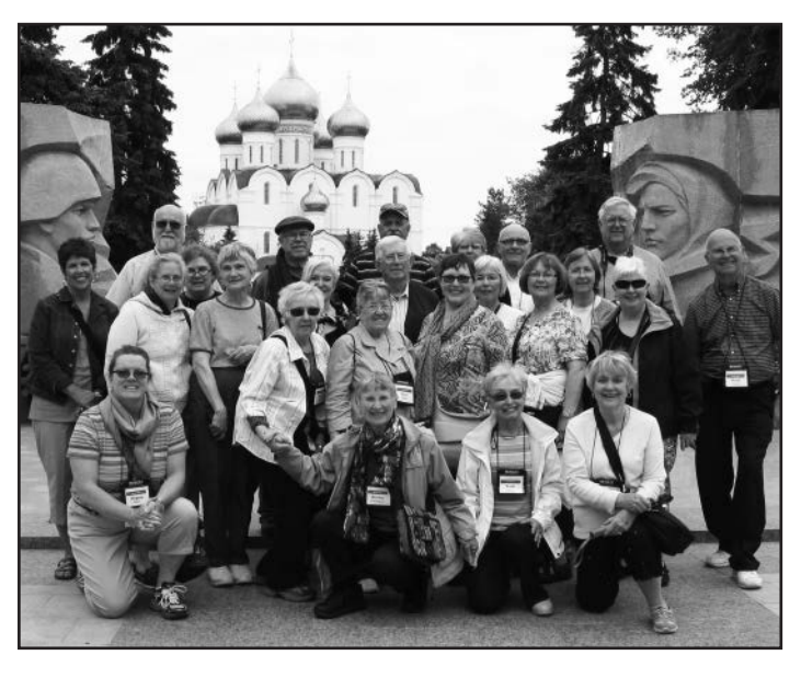
OLLI members pose for a group picture during their 14-day trip from St. Petersburg to Moscow, Russia in May 2013.

Our day in Pontiac will begin with a visit to the Route 66 Association of Illinois Hall of Fame and Museum, which features The Route 66: Photo Journal exhibit and a fascinating display about life in the 1940s. We'll also visit the Livingston County War Museum, which many equate to taking a tour of the 20th Century, as it features artifacts, films, books, uniforms, and weapons of several wars: World War I, World War II, the Korean Conflict, the Vietnam War, Operation Desert Storm, and even current conditions in Iraq and Afghanistan. Next, we'll hop aboard a trolley for a guided tour of the town's 20 outdoor murals which depict its local commercial, cultural, and political history. Most were painted by the Walldogs, a collection of 150 sign painters and muralists who came to town in 2009 and painted 18 murals in just four days. We'll also visit the town's three swinging bridges and tour the Pontiac