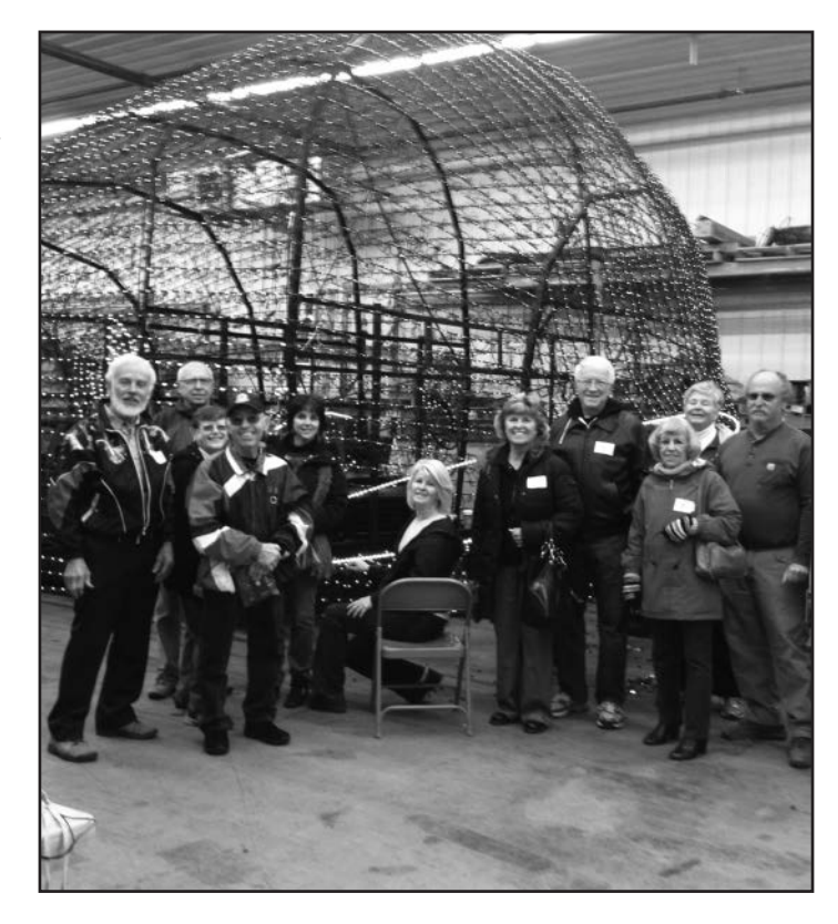
OLLI members enjoy a behind-the-scenes look at the floats used in East Peoria's Festival of Lights parade.

$25 – includes lunch, gratuities, tour, and van/shuttle transportation