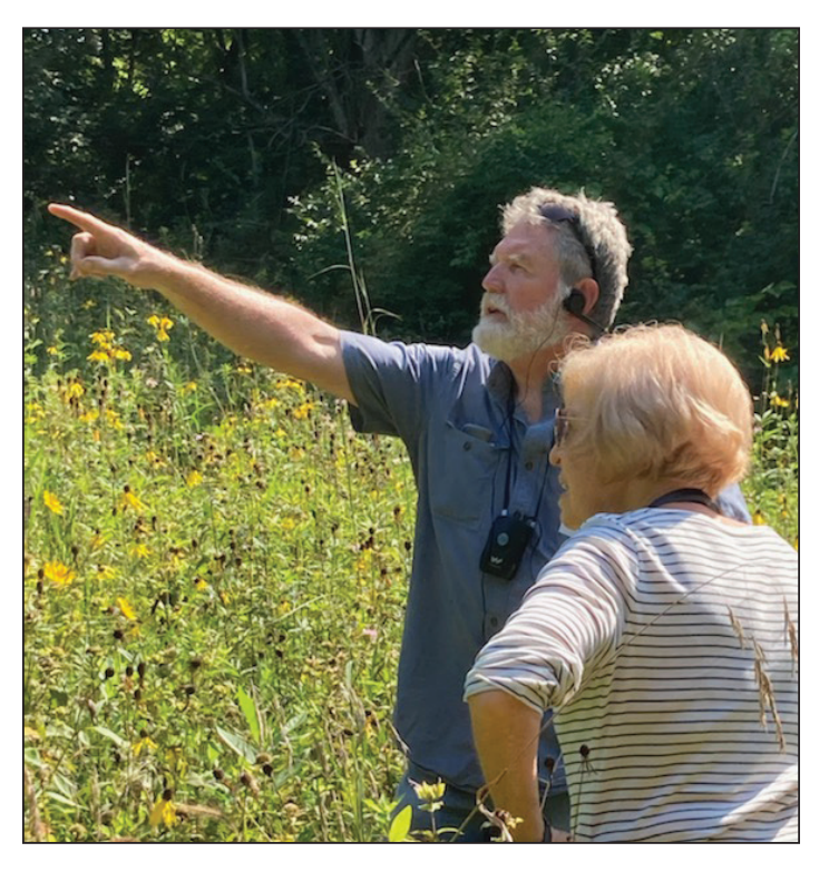
OLLI members enjoy a hike to a prairie at Horseshoe Bottoms in Peoria.

$35 – includes guided tour, lunch at local restaurant, gratuities and shuttle transportation. A detailed itinerary will be emailed to you prior to the trip.