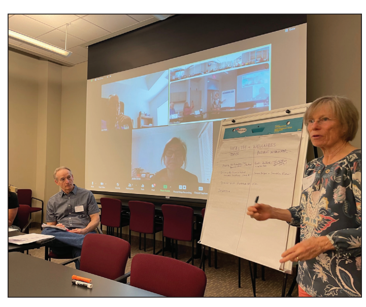
Our volunteer Curriculum Committee is hard at work developing programming for upcoming classes.