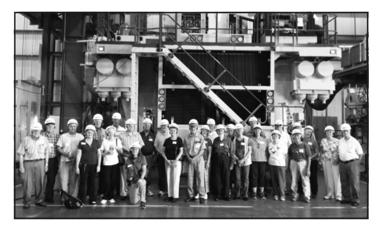
OLLI members don their hard hats for a tour of the Komatsu facility.