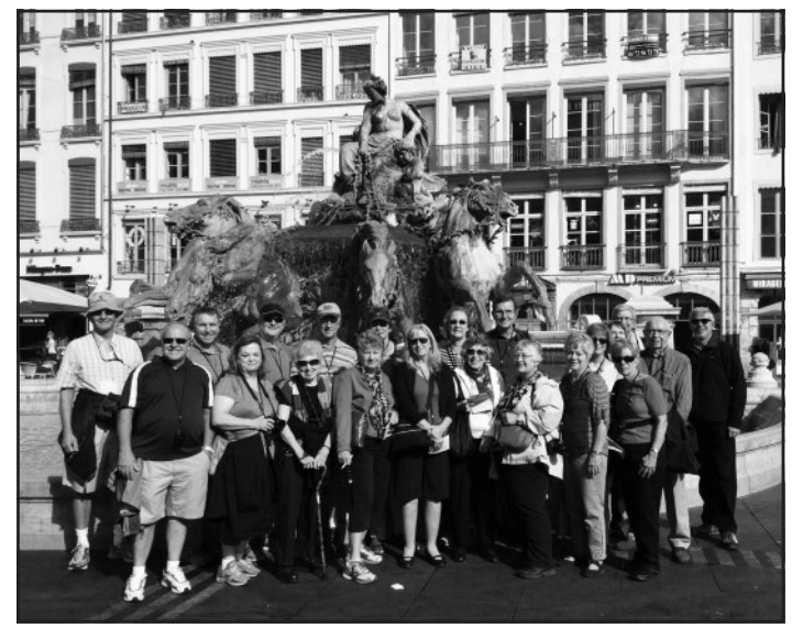
The OLLI gang poses for a photo on a beautiful day during our tour of France.

This acclaimed 2014 documentary film tells the story of a mysterious nanny who secretly took over 100,000 photographs that were then hidden in storage lockers with other memorabilia of her work and life and not discovered until decades later. Through the efforts of filmmaker and photographer John Maloof, people all over the world are now able to view the work of a woman who is considered one of America's most accomplished and insightful street photographers in the 20th century. Not only is her photography thought-provoking and riveting, but so is her life. Our conversations will explore street photography and its conventions and some of the world's most famous street photographers. We will also discuss how a hoarding disorder might have played a role in the life of Vivian Maier. $29 – Discussions led by Ray Keithley, President of the Peoria Camera Club and past OLLI President, and Kate Varness, a certified professional organizer, life coach, and owner of Green Light Organizing.