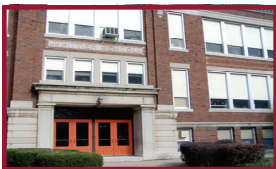
Whittier Primary School