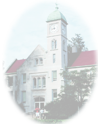
HISTORIC WESTLAKE HALL