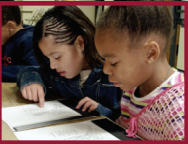
Third grade students at Whittier.

Whittier Primary School received the National Blue Ribbon Award from the Department of Education in 2005. In addition, they were one of five recipients of the National Center for Urban School Transformation's Excellence in Education awards. Whittier has been an Illinois Spotlight School for three years in a row. In September, 2006, the school was named an Exemplary School by the U.S. Department of Education, the only school in the entire State of Illinois to receive such a distinction.