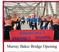
Murray Baker Bridge Opening

Roosevelt Magnet School was selected as a Professional Development School site by the College of Education and Health services at Bradley University in the fall of 1999. The college's partnership with Roosevelt is focused on supporting students' learning, preparing professionals in education and health, promoting professional development, and promoting inquiry and research to improve practice.