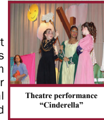
Theatre performance "Cinderella"

The mission of Roosevelt Magnet School, as an innovative fine arts academy, is to ensure that each student develops to his or her academic, artistic, and personal potential by integrating the arts and technology within a safe, nurturing environment, which embraces diversity in partnership with families and the community.