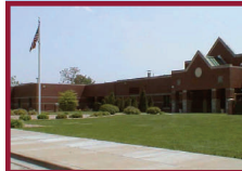
Valeska Hinton Early Childhood Center

At Valeska Hinton, students go to school throughout the year. The Center was designed to develop and encourage long-term family and staff relationships through the sense of community. The architecture of the building reflects a modern exterior and is composed of four villages. Our motto of It takes a village to raise a child turns theory into practice.