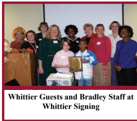
Whittier Guests and Bradley Staff at Whittier Signing

Whittier has had a long association with Bradley's Department of Teacher Education and has opened classrooms to many student teachers and observers. When the Kemper Foundation had an opportunity to add a PDS site, Whittier was the perfect choice. Whittier Primary School became our 4th PDS partner in the Fall of 2006. We celebrated the signing of our partnership contract at a luncheon hosted by the Kemper Foundation at Bradley University. Partnership goals this year include increased daily and meaningful writing, working with best practices in the classroom as well as providing technology in Whittier's new computer lab.