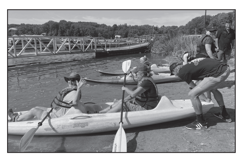
Kayaking with OLLI is fun and easy!

$35 – includes guided tour, lunch at a local restaurant, gratuities, and shuttle transportation.