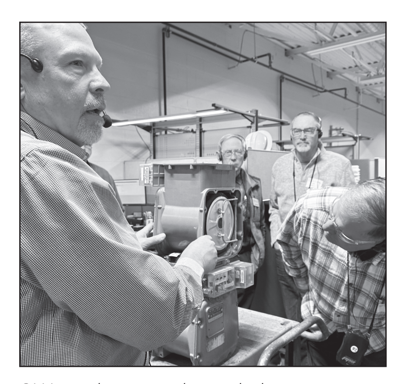
OLLI members get a close up look at a gas meter during a tour of the Ameren Gas Metering Shop.

$5 – includes moderated discussion prior to the start of the film screening. Transportation not provided – meet us there!