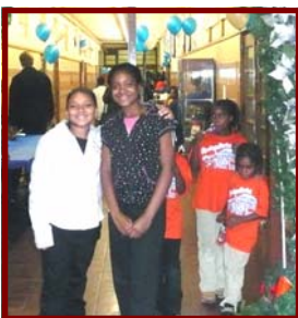
Roosevelt students celebrating the 100th anniversary of their school!

Roosevelt's mission, as an innovative fine arts academy, is to ensure that each student develops to his or her academic, artistic, and personal potential by integrating the arts and technology within a safe, nurturing environment which embraces diversity in partnership with families and the community.