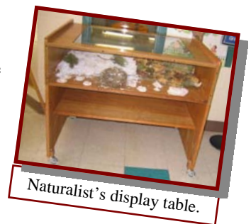
Naturalist's display table.

The Naturalists have been infusing nature to the curriculum. A display table has been added to Center Court. The table contains various items from each season which can be found in nature. The display was entitled, "I Spy with My Little Eyes," as students look to find familiar items and animal tracks. A Nature Calendar was added to the Nature Nook and many more items were added to the central bulletin board. The committee is also looking into possible grants to create a natural garden environment with a water feature. Their slogan is, Recycle, Reduce, Refuse, and Reuse. The Refuse refers to not purchasing or using non-biodegradable materials.