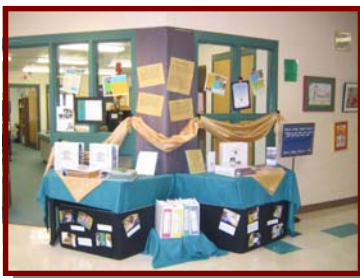
Portfolios and document display for NAEYC Accreditation