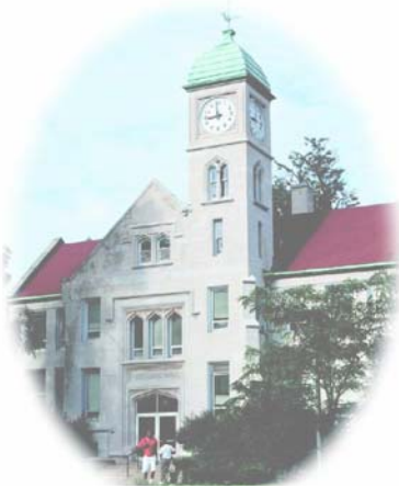
Historical Westlake Hall