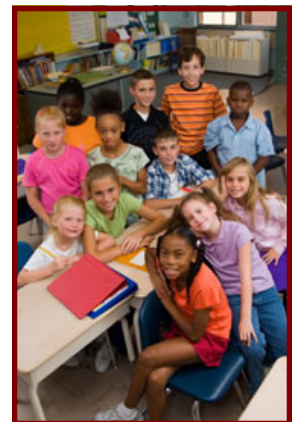
Planning for the festive celebration!