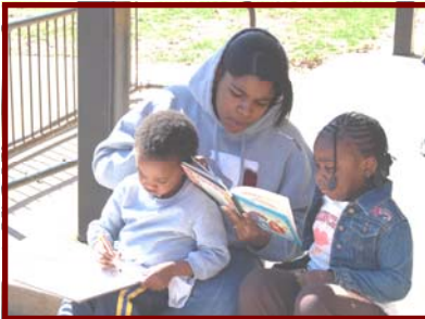
Bradley novice teacher with pre-school students at Manual.