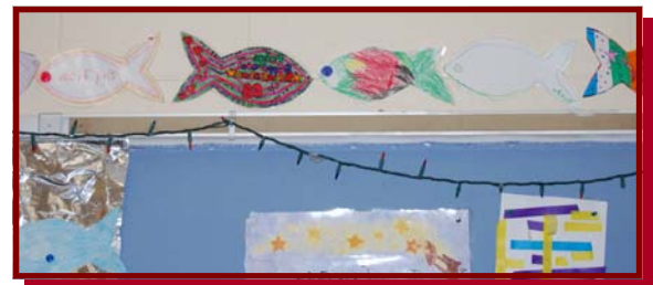
FISH! bulletin board display in Manual pre-school classroom.

It is evident that both her “Big” Fish (high school students) and “Little” Fish (preschool children) benefit from the four components of Play, Make Their Day, Be Present and Choose your Attitude .