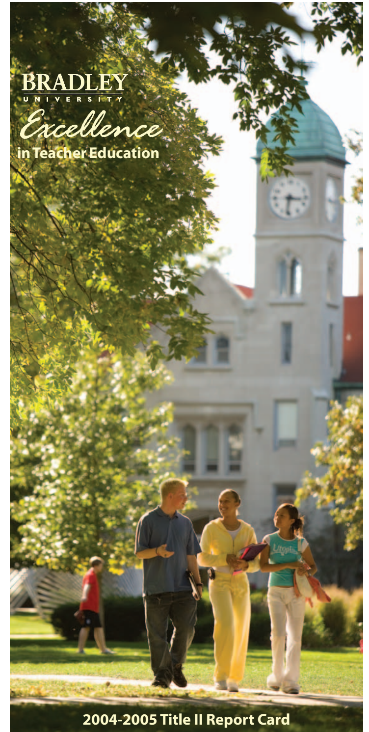
2004-2005 Title II Report Card

Department of Teacher Education College of Education & Health Sciences 1501 W. Bradley Ave. Peoria, IL 61625