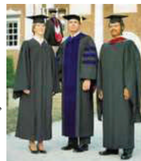
The gown for the Master and Doctorate degrees are different from the Bachelor degree.

The Bradley Bookstore also has invitations, diploma frames and many other graduation accessories available. Stop in and see their selection. The Bradley Bookstore will also be at the Graduation Fair.