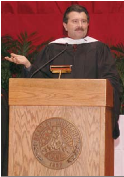
The late Jerry Hadley '74 , internationally known tenor and three-time Grammy Award winner, gave the address during Bradley's mid-year commencement in 2004.

Internationally known tenor and three-time Grammy Award winner Jerry Hadley '74 died July 18, 2007. He was regarded as the leading American tenor of his generation. Born June 16, 1952, he received international acclaim for his interpretation of the great Mozart operatic tenor roles, as well as those of the French romantic and Bel Canto eras. He was becoming increasingly known for his expertise with twentieth century and American operas. His equal ease in the realms of Broadway musical theater, operetta, and popular song made him one of the most versatile of artists.