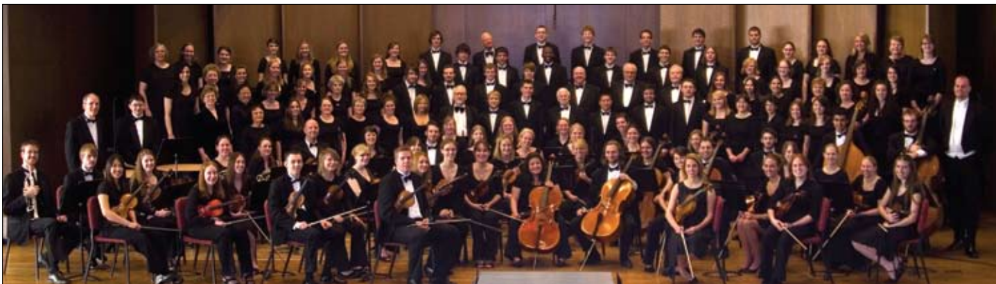
The Bradley Symphony Orchestra