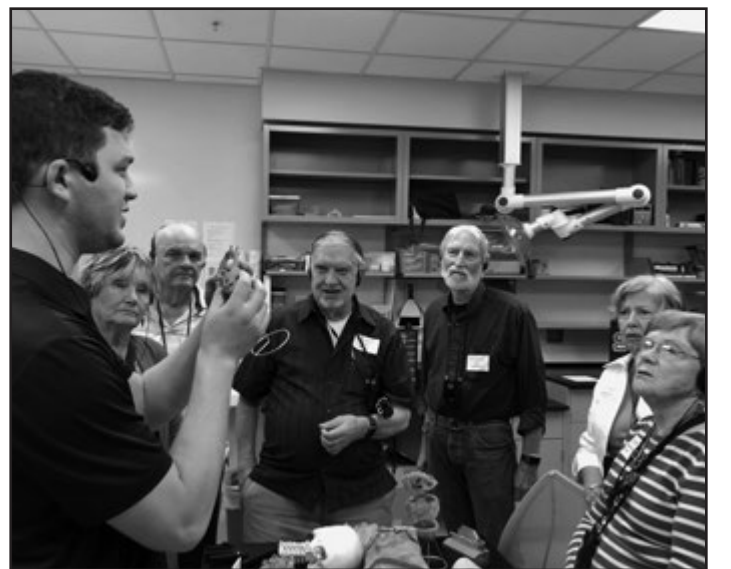
At the JUMP Trading Education Lab, OLLI members see inside a model of a heart.