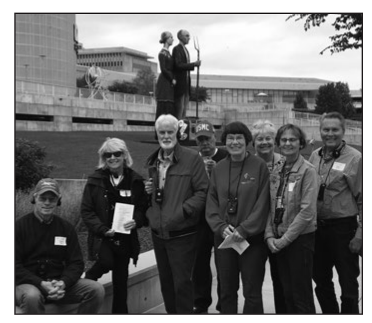
OLLI members take a break on the Sculpture and Monument tour to pose by Seward Johnson's sculpture God Bless America.

Peoria-based Natural Fiber Welding, Inc. (NFW) is a chemistry and technology company poised to offer sustainable alternatives to nonrenewable plastics and produce high value materials from low cost, highly functional naturally occurring fibers. NFW is the product of more than $10 million of transformative fundamental and applied research funded by several Department of Defense initiatives. Join OLLI as we tour NFW and learn how plant-based leather (without any plastic) is made. $30 – includes lunch at a local restaurant, gratuities, tours, and shuttle transportation (NT)