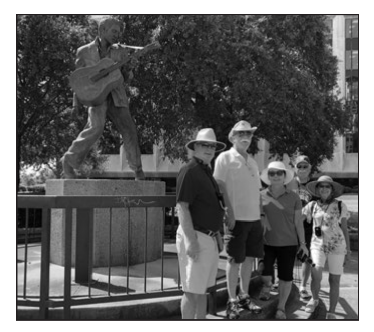
OLLI members have an Elvis sighting during a multi-day trip to Civil War sites.

LG Seeds is part of AgReliant Genetics, LLC, one of the largest independent, seed-only organizations in the United States, producing seeds for corn, soybeans, and alfalfa. On this learning trip, we will visit the LG Quality Assurance testing facility in Brimfield and learn how the products are assessed through over 33 different quality tests, including warm and cold germination and electrophoresis. We'll also learn more about the overall lab operations that help provide customers with products of the highest quality. $30 – includes lunch at a local restaurant, gratuities, tour, and shuttle transportation (RT)