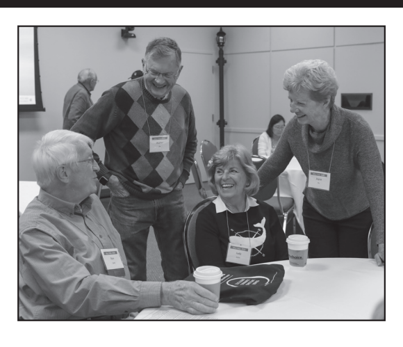
OLLI class break time is a great opportunity for members to discuss their classes.