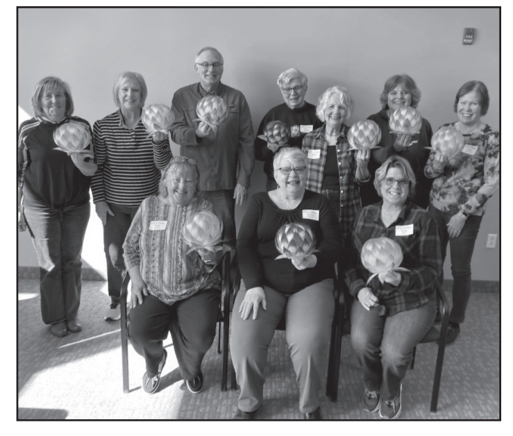
OLLI members make lotus lanterns with the Korean Spirit and Culture Promotion Project.