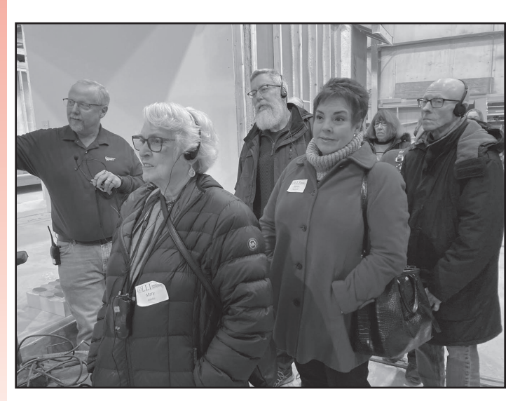
OLLI members get a close-up look at the construction at Homeway Commerical.

$40 – includes lunch at a local restaurant, gratuities, tour, and shuttle transportation. A detailed itinerary will be emailed to you prior to the trip.