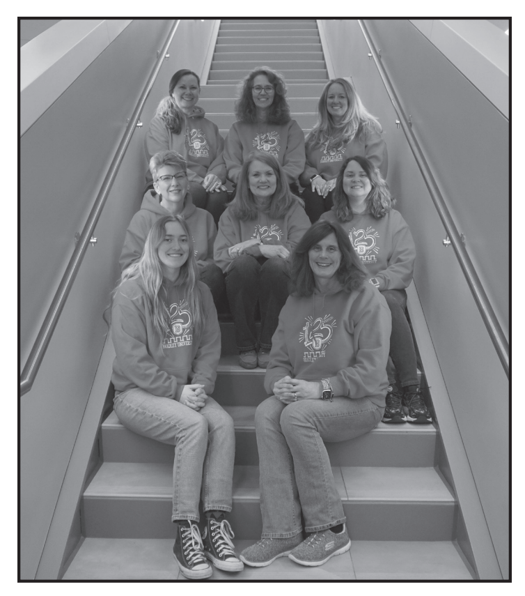
Continuing Education staff members show school spirit with their BU 125th anniversary hoodies.

In the rare case that Bradley University is closed due to inclement weather, all OLLI programs scheduled for that day will also be cancelled. Please refer to local television and radio stations for closing information.