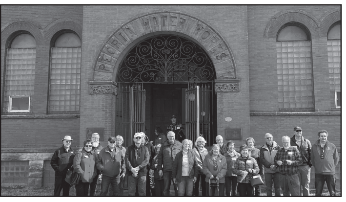
OLLI members pose in front of the historic Peoria Water Works building on a trip to Illinois American Water Company.

$15 per person. A Zoom link will be sent the morning of the event