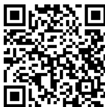
There Will Never Be Another You

I very much look forward to hearing all interested in singing vocal jazz at Bradley. If you have any questions, feel free to contact me at srockford@bradley.edu . We have an exciting year planned!