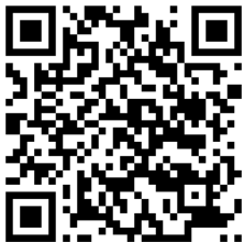
All of Me